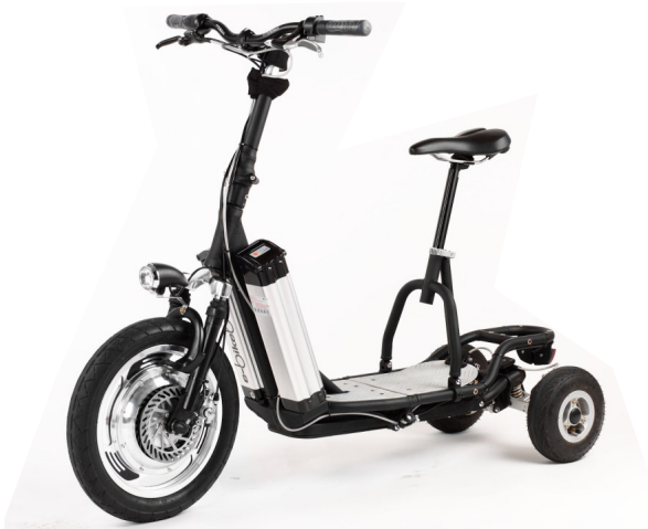
Bikeboard seats available

Naturally we carry comprehensive public liability insurance with an American-based “A” rated insurance carrier. The insurance has limits of liability not less than $1,000,000 combined bodily injury and property damage.