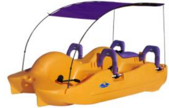
Double Pedal Boat