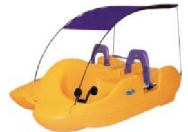
Single Pedal Boat